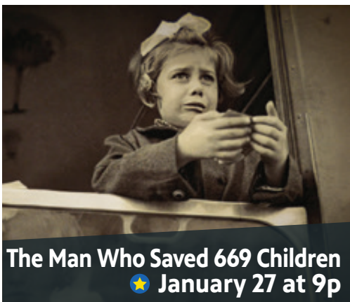
The Man Who Saved 669 Children ★ January 27 at 9p

NEW 11p Luna & Sophie: Hatred Is My Hobby #312 Online trolls become murder suspects when a climate activist is found dead.