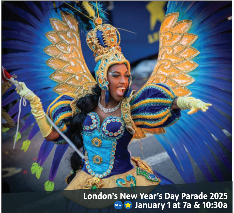
London's New Year's Day Parade 2025 NEW ★ January 1 at 7a & 10:30a

The 50th season of Austin City Limits continues on January 11, featuring performances by Norah Jones, followed in subsequent weeks by The Avett Brothers and Mickey Guyton. Stay tuned later this spring for a spectacular celebration of 50 years of